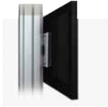
LCD bracket kit