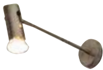
Spotlight 100 watt