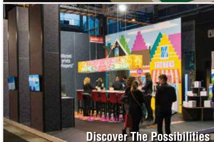
Discover The Possibilities