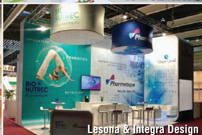
Lesona & Integra Design