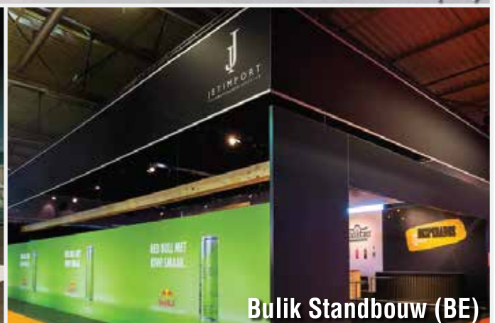
Bulik Standbouw (BE)