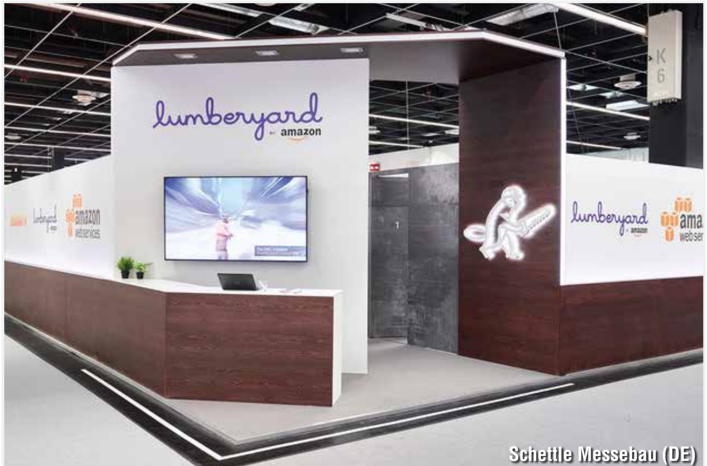
Schettl Messebau (DE)