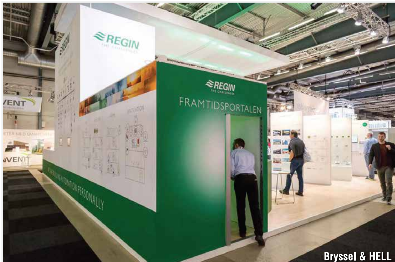
Bryssel & HELL