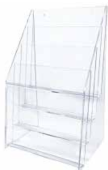
4 Pocket Literature Holder