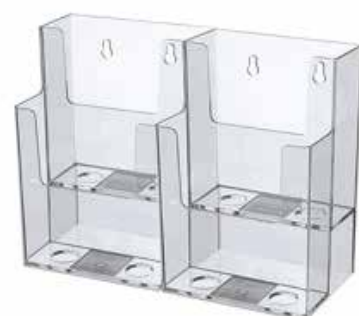
4 Pocket Literature Holder