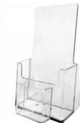
Holder c/w Vertical Biz Pocket