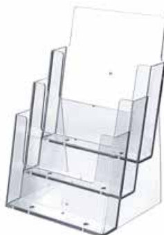
3 Tiered Letter Size