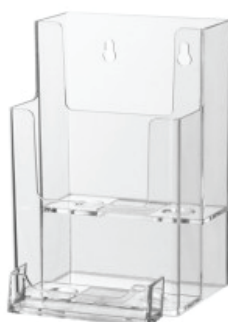
2 Tiered Holder c/w Biz Pocket