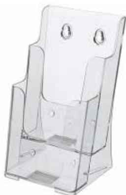
2 Tiered Brochure Holder