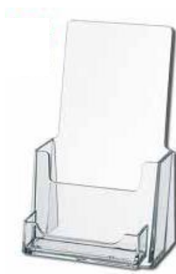
Trifold Holder c/w Biz Pocket