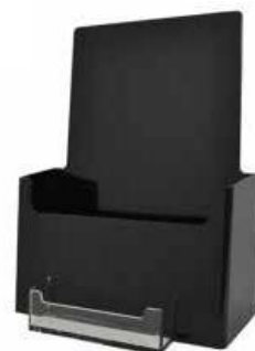
Black Pamphlet Holder c/w Biz Card Pocket